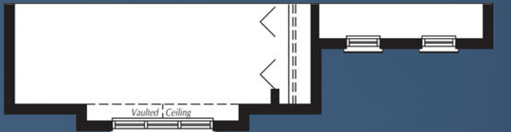
SECOND FLOOR 4 BEDROOM OPTION ELEVATION B