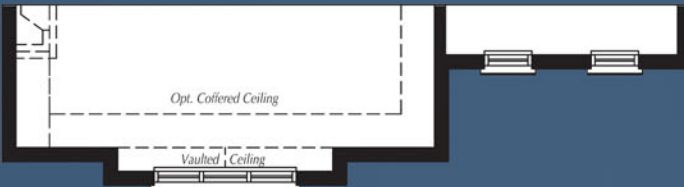
SECOND FLOOR ELEVATION B